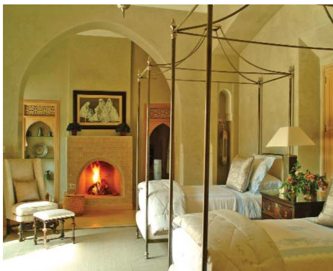
Bedroom 4 - Twin beds each 40 ins wide

One set of French doors open onto the main courtyard with its marble fountain and delicately carved "B'hau" (a cosy Moroccan seating alcove). The other french doors look out on a private garden with seating area. The en suite bathroom has its own separate WC, marble shower, with traditional high vaulted ceilings and frenches doors opening directly onto the garden.