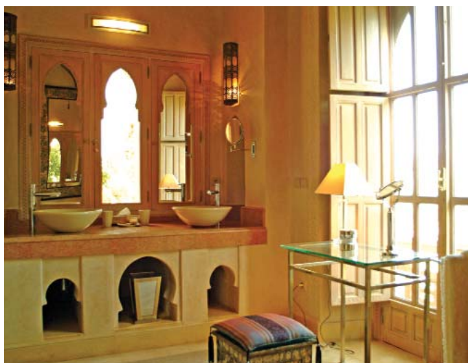
Bedroom 3 - Moroccan Room Double bed 180 cm (6 ft)

This is an enchanting room with many traditional Moroccan features - it has its own dressing area, separated from the bedroom by an exquisitely carved screen. There is a pretty carved zellige corner fireplace and a large mirror and chest of drawers intricately carved in cream bone.